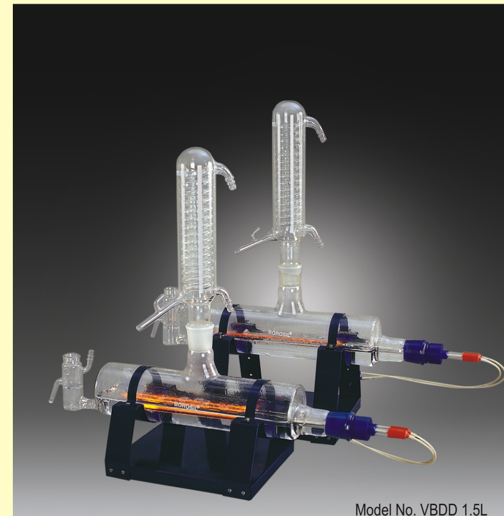
Model No. VBDD 1.5L