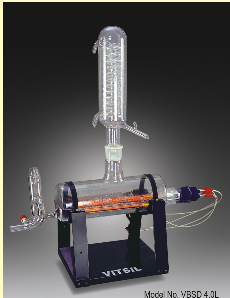
Model No. VBSD 4.0L